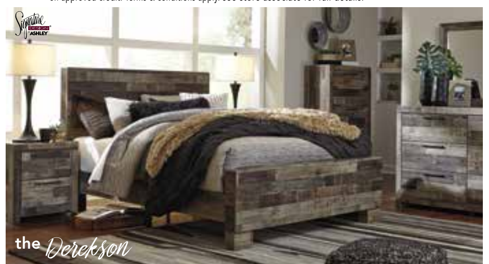
QUEEN PANEL HEADBOARD Mirror $119, 6 Drawer Dresser $549, 5 Drawer Chest $549, Nightstand $299