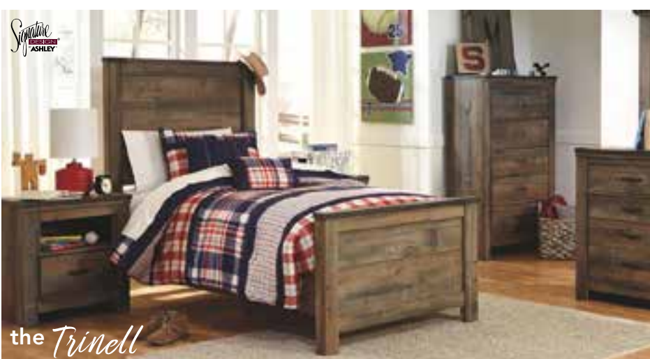
TWIN HEADBOARD 5 Drawer Chest $599, Mirror $149, Dresser $699, Nightstand $349