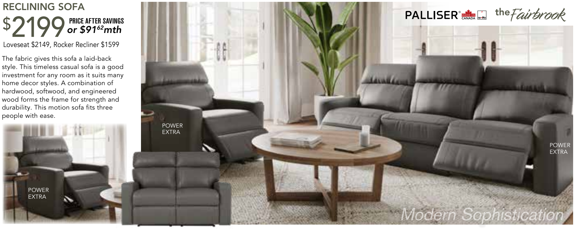
A PALLISER Elegant Styles