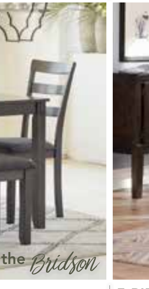
6 PIECE DINETTE Includes dining table, bench and 4 dining chairs

QUEEN HEADBOARD $10<sup>38</sup>mth or the Haddigan