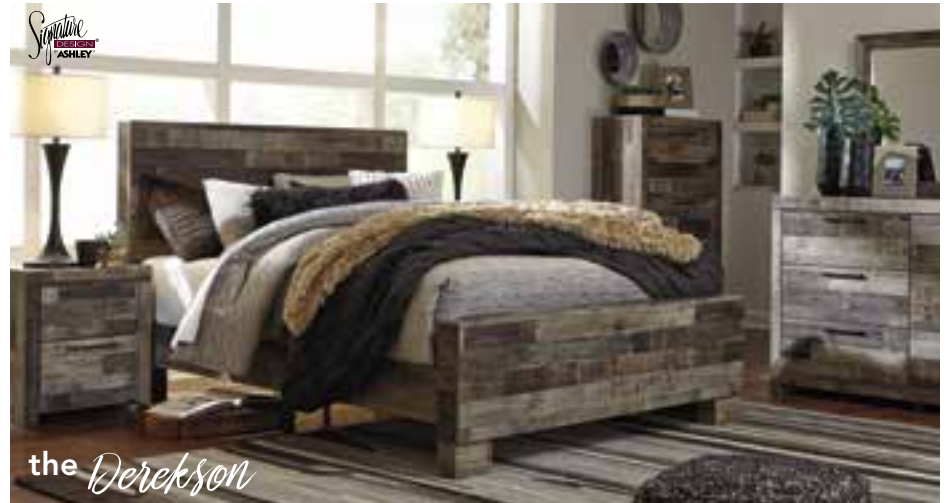
QUEEN PANEL HEADBOARD Mirror $119, 6 Drawer Dresser $549, 5 Drawer Chest $549, Nightstand $299