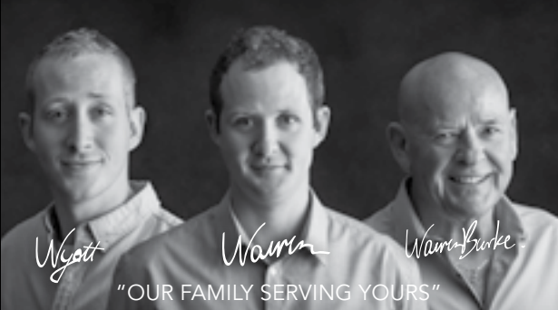
"OUR FAMILY SERVING YOURS"

fastfurniture.ca 115 Disco Street, Sydney, N.S. Phone: 539-4000