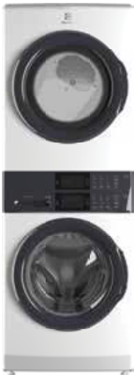
Laundry Tower Single Unit Front Load 5.1 cu. ft. I.E.C Washer and 8 cu. ft. Electric Dryer Features a stacked design that takes up half the floor space, freeing up the laundry room for extra storage ELTE730CAW