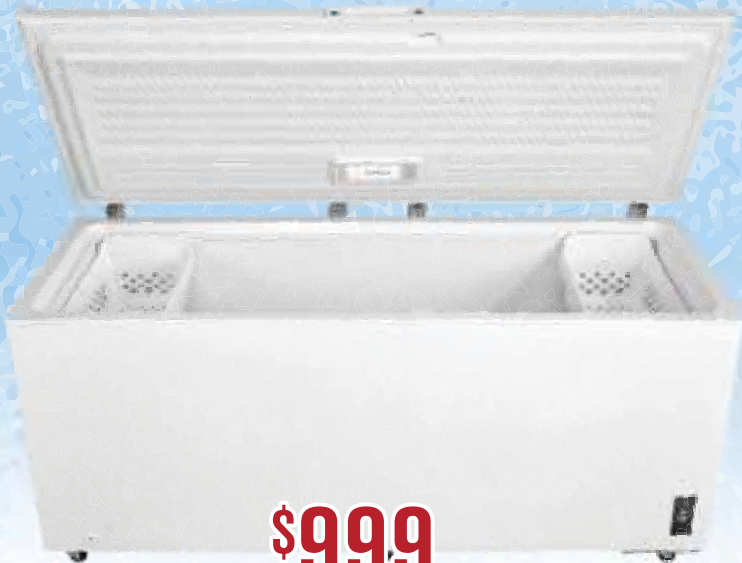
15 cu. ft. Garage Ready Upright Freezer Great for storing large or small items, this chest freezer features a removable basket, making it easy to grab what you need and stay organized. FFCL1542AW