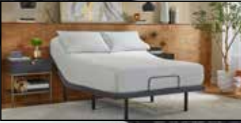
Lifestyle Base Friendly