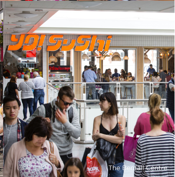
The Berrall Centre