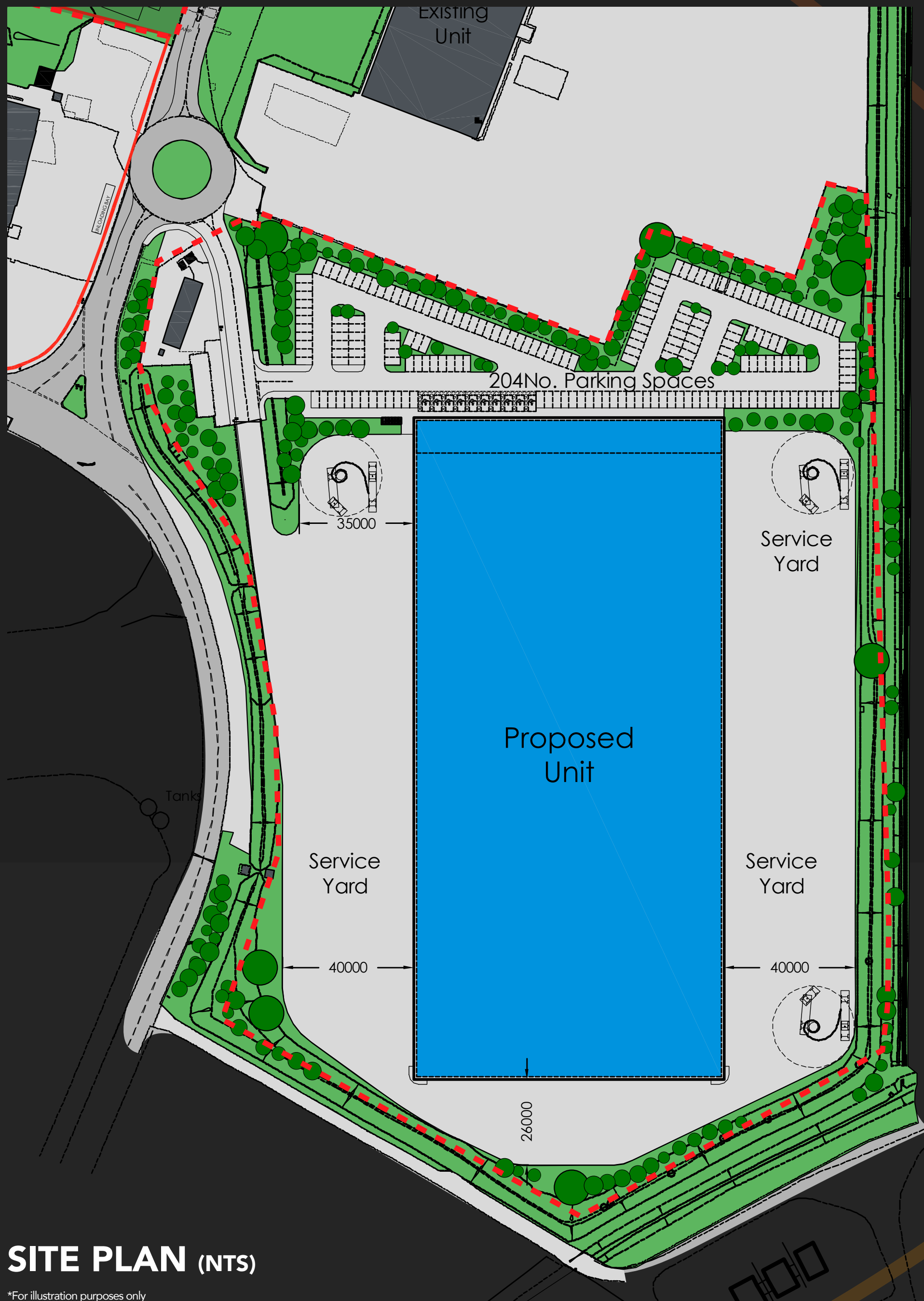
SITE PLAN (NTS)