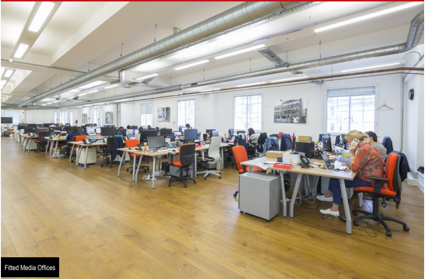
Fitted Media Offices