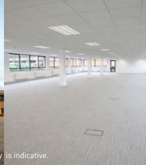
All photography is indicative.