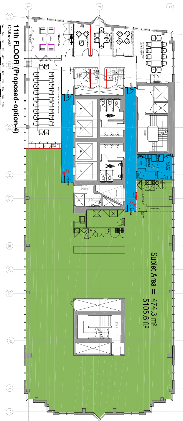
11th FLOOR (Proposed-option-4)