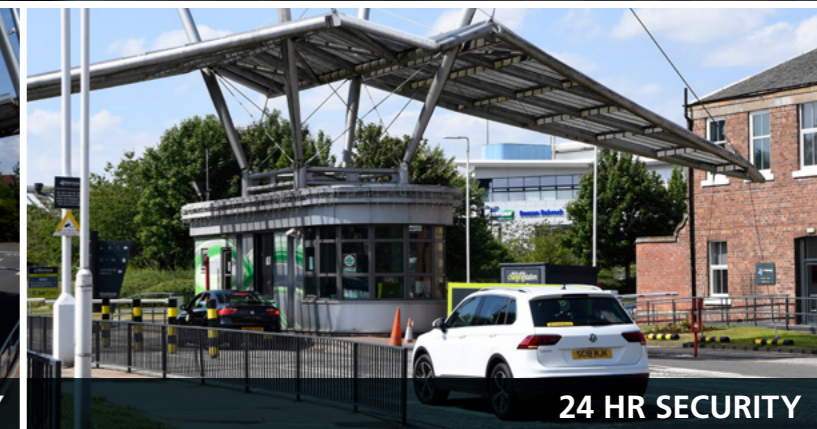
24 HR SECURITY