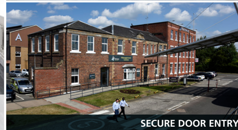
SECURE DOOR ENTRY