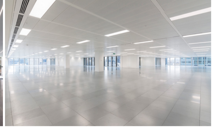
TO VIEW MORE PHOTOS, CLICK HERE

THE ... FINAL, AFTERMOST, CLOSING, CONCLUDING, ULTIMATE, TERMINAL, VALEDICTORY, LAST ... FLOOR AT ONE CREECHURCH PLACE EC3