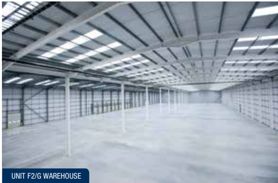
UNIT F2/G WAREHOUSE