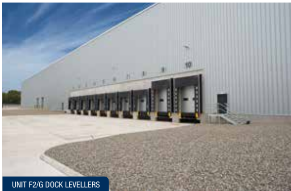
UNIT F2/G DOCK LEVELLERS