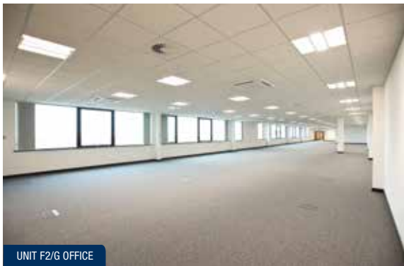
UNIT F2/G OFFICE