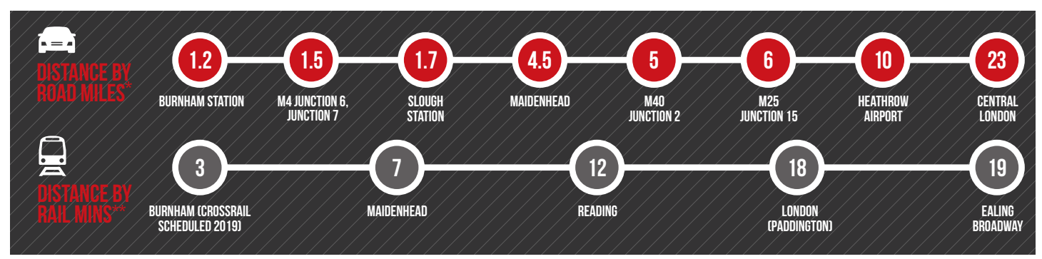
SOURCE: * FROM 898 PLYMOUTH ROAD SL1 4LP. SOURCE: THE AA ** TIMES FROM SLOUGH STATION. SOURCE: NATIONAL RAIL ENQUIRIES