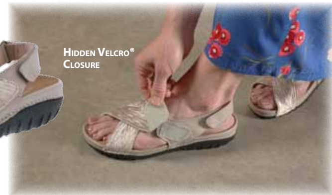
HIDDEN VELCRO® CLOSURE