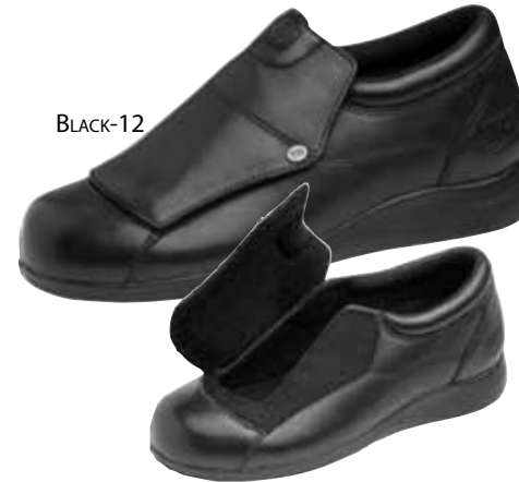
VICTORIA 14463 LEATHER