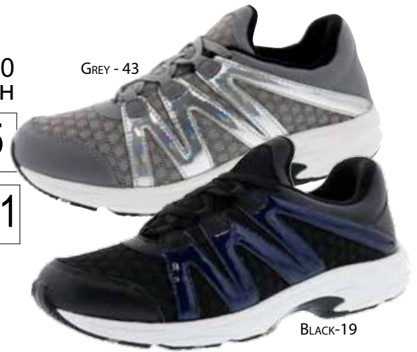
GREY - 43