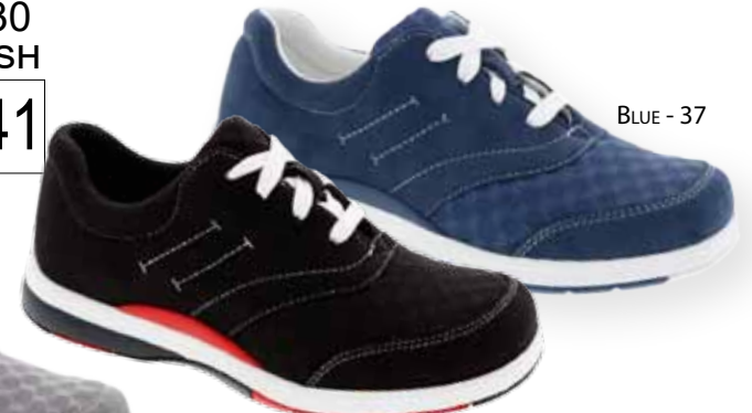
BLUE - 37