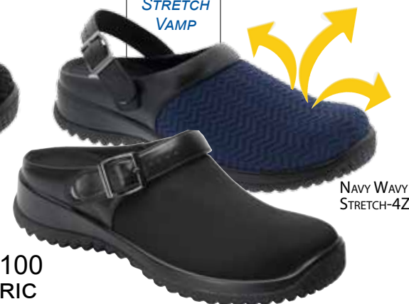
NAVY WAVY STRETCH-4Z