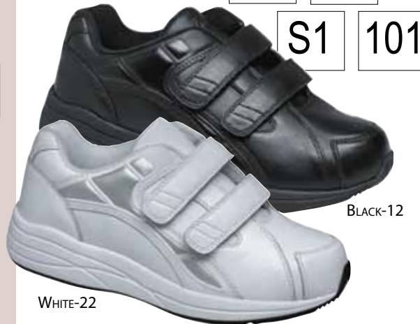
MOTION V 14406 LEATHER