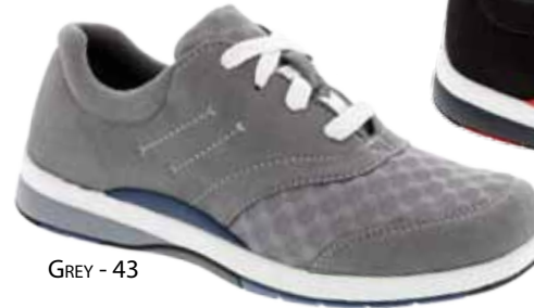
GREY - 43