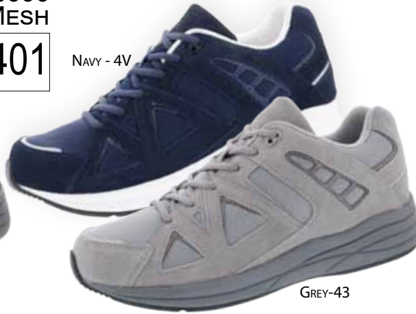
NAVY - 4V