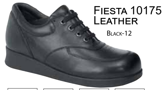
FIESTA 10175 LEATHER