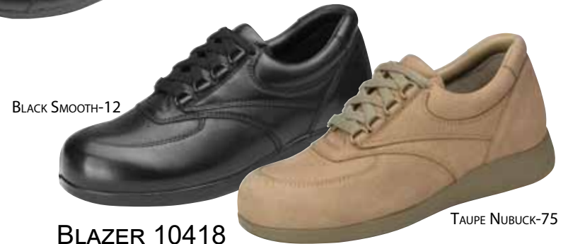
BLAZER 10418 LEATHER