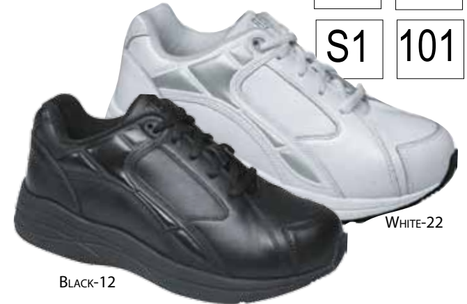
MOTION 10186 LEATHER