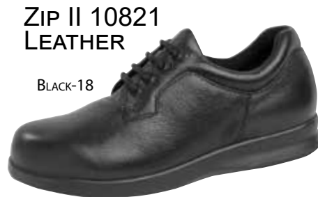
ZIP II 10821 LEATHER