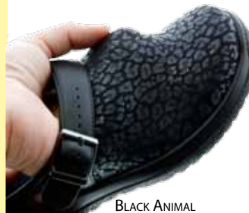
BLACK ANIMAL PRINT -9F