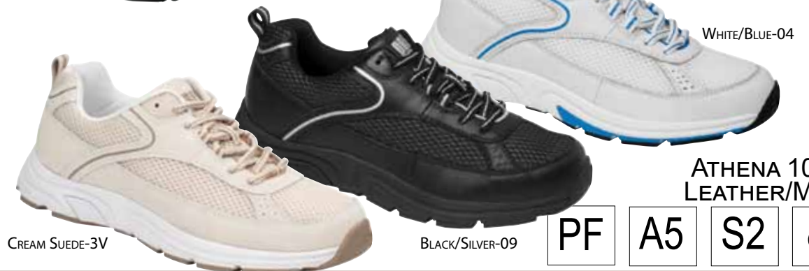
ATHENA 10268 LEATHER/MESH