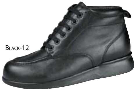
PHOENIX PLUS 10217 LEATHER