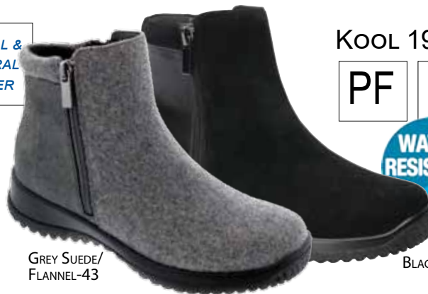
GREY SUEDE/ FLANNEL-43