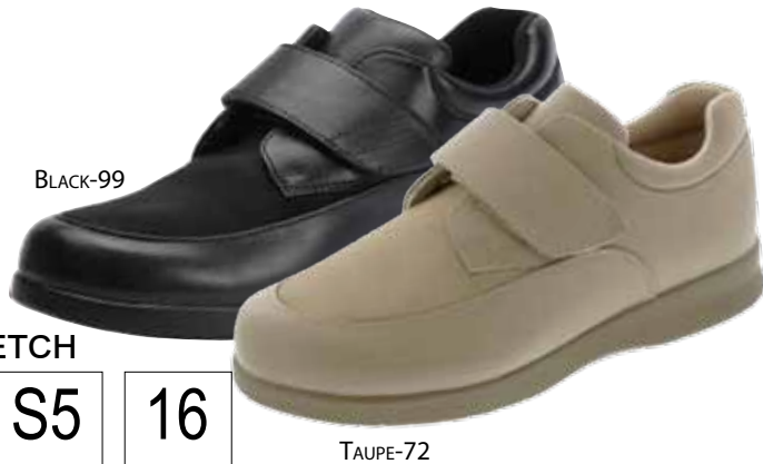
QUEST 14251 LEATHER/STRETCH