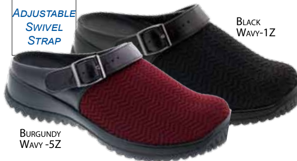
BURGUNDY WAVY -5Z