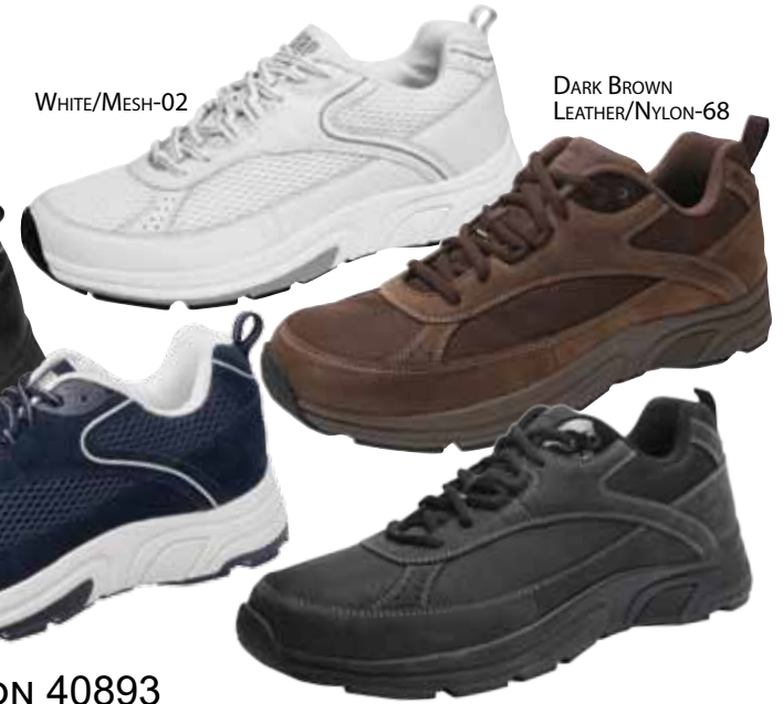
DARK BROWN LEATHER/NYLON-68