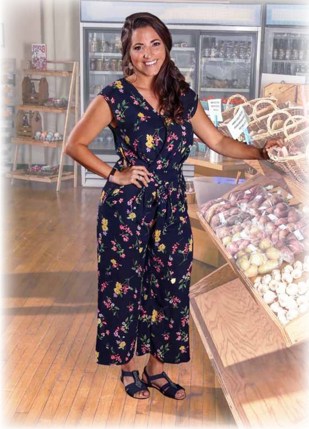
A. MIRIAM 67028 (10) Black, (38) Sand, (47) Navy | B. MACKENZIE 67021 (10) Black, (1G) Black Multi, (73) Taupe Multi, (4G) Blue Multi | C. MELLOW 67012 (38) Sand, (10) Black, (47) Navy