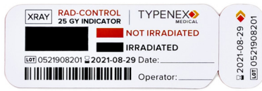
Rad-Control Standard after irradiation

Choose from three different types of indicator tags — each equipped with innovative technology, easy-peel adhesives, and customizable fields. With no need for refrigeration or manual data entry, Rad-Control Irradiation Tags can help conserve storage space and reduce the risk of transcription errors.