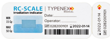
Rad-Control Scale after irradiation