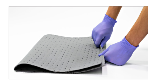
5. REMOVE the soiled mat from the floor by pulling from a corner and grabbing the underside of the mat. Handle carefully per your facility's personal protective equipment (PPE) protocol.

▲ USE CAUTION when standing or walking on mats.