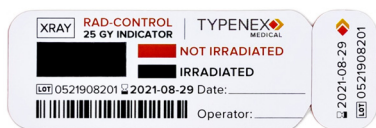
Rad-Control Standard after irradiation

Choose from three different types of indicator tags — each equipped with innovative technology, easy-peel adhesives, and customizable fields. With no need for refrigeration or manual data entry, Rad-Control Irradiation Tags can help conserve storage space and reduce the risk of transcription errors.