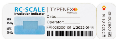
Rad-Control Scale after irradiation