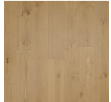
PUERTA OAK WED17-04