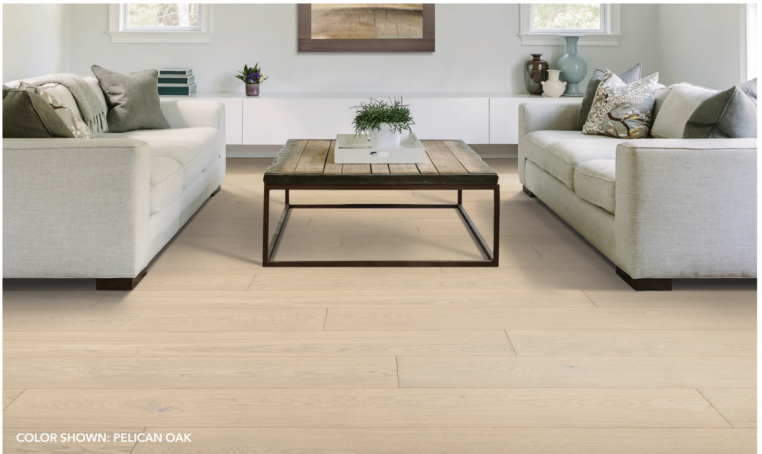
COLOR SHOWN: PELICAN OAK