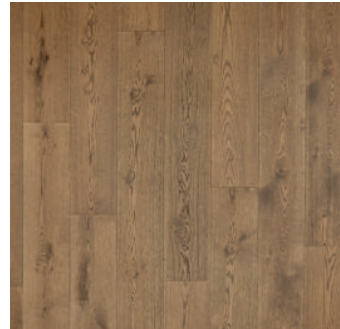
MARINA OAK WED17-03