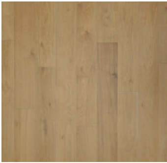
PARCHMENT OAK WED16-05