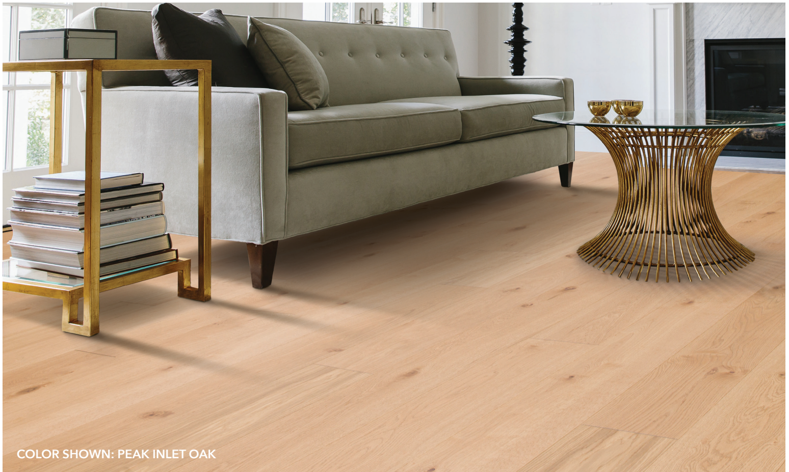
COLOR SHOWN: PEAK INLET OAK