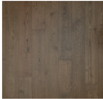
AMHERST OAK WED16-06