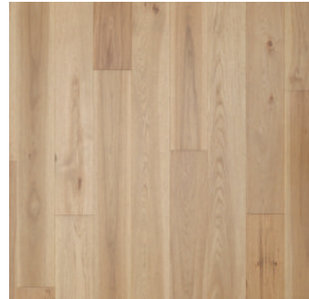
OXHIDE HICKORY WED16-03