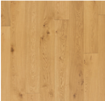
PEAK INLET OAK WED16-01