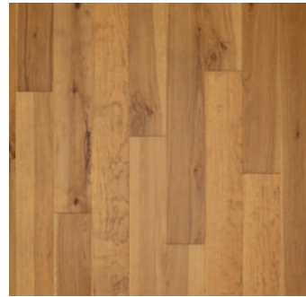
HIGH DESERT HICKORY WED16-07