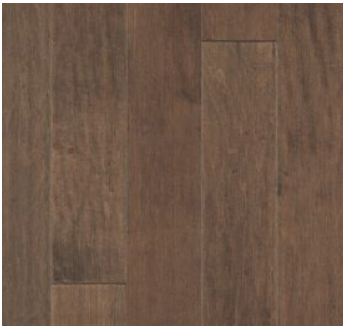
MOCHA MAPLE WEK10-12