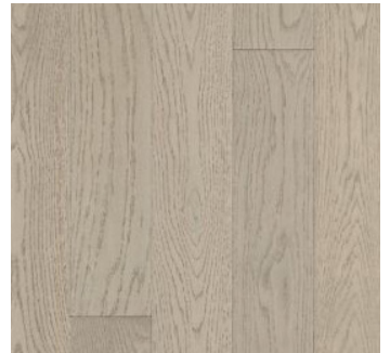
SANDSTONE OAK WEK10-78