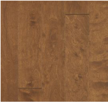
BANISTER BIRCH WEK10-74