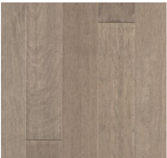
STEEL MAPLE WEK10-75