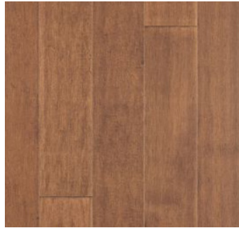
DARK AUBURN MAPLE WEK10-02