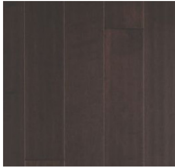
CHOCOLATE MAPLE WEK10-11