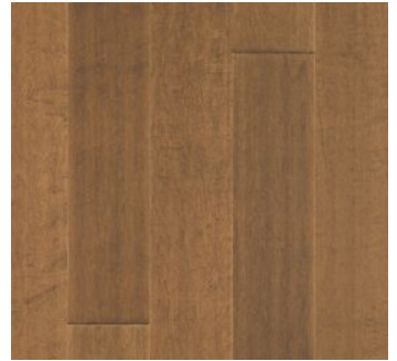
LIGHT AMBER MAPLE WEK10-01