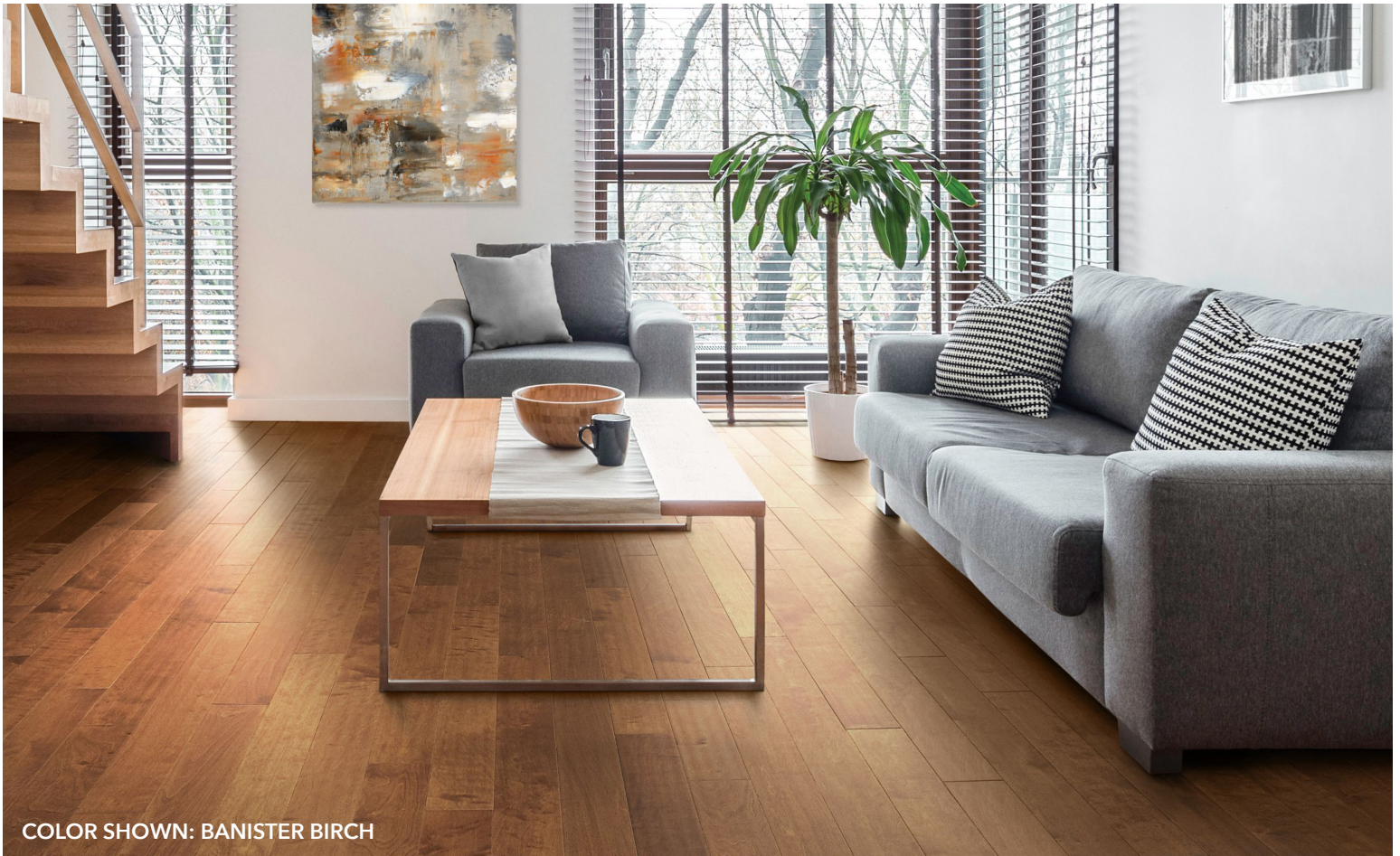
COLOR SHOWN: BANISTER BIRCH