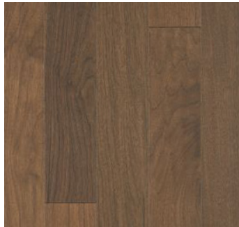
NATURAL WALNUT WEK10-04 SHADE VARIATION: HIGH HARDNESS: LOW