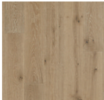
CATAMARAN OAK WEK05-32