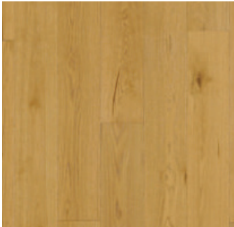
NATURELE OAK WEK05-27