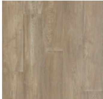
COASTAL FOG OAK WEK05-28