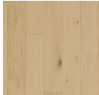
SAND PEARL OAK WEK05-29