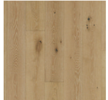
SEAGLASS OAK WEK05-30