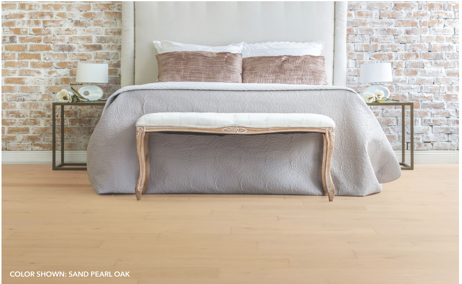
COLOR SHOWN: SAND PEARL OAK