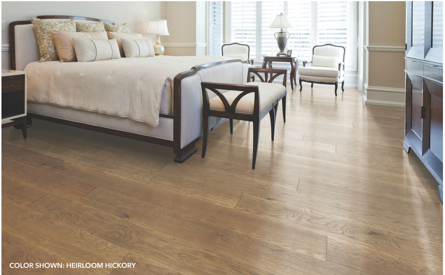
COLOR SHOWN: HEIRLOOM HICKORY