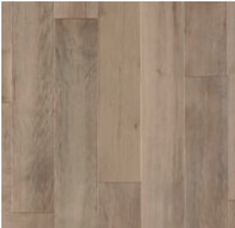
CANYON DUST HICKORY WEK06-66