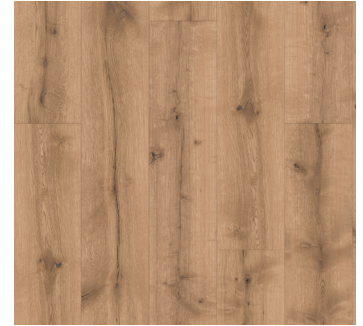
MINK OAK | 861