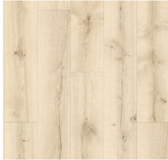
PALOMINO OAK | 133