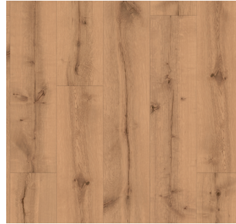
SABLE OAK | 352