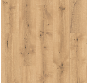
TAWNY OWL OAK | 158

Colors will stay vibrant for a lifetime and will resist fading from sunlight.