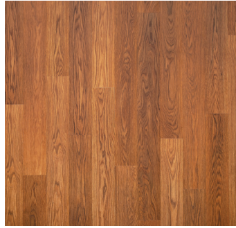
SMOOTH AMBER OAK | 03