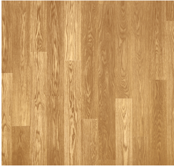
TENNESSEE RYE OAK | 01

Colors will stay vibrant for a lifetime and will resist fading from sunlight.