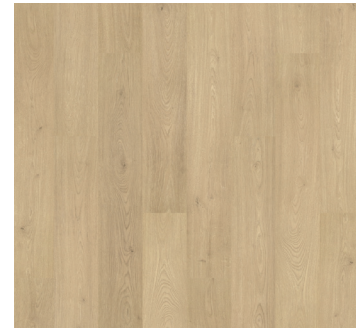
SIERRA SAND OAK | 938