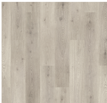
SUNSHOWER OAK | 935