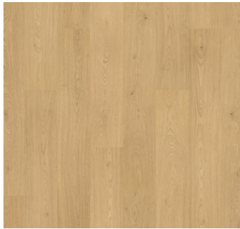
GOLDEN HOUR OAK | 122

Colors will stay vibrant for a lifetime and will resist fading from sunlight.