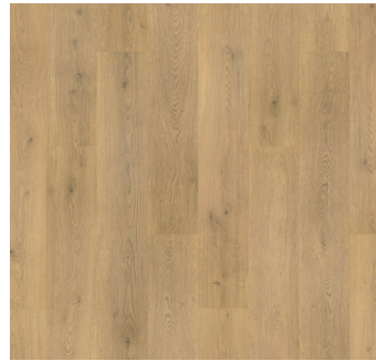
TULIP SHELL OAK | 248