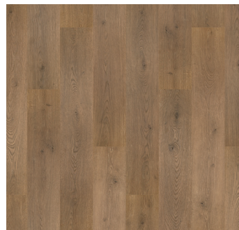
DOCKSIDE OAK | 852