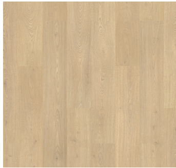
SUNBLEACHED OAK | 831