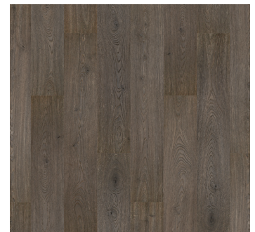
ANCHOR OAK | 988