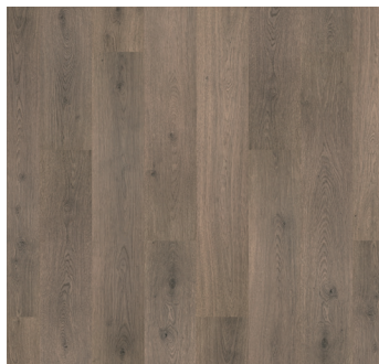
CLOUDY OAK | 958