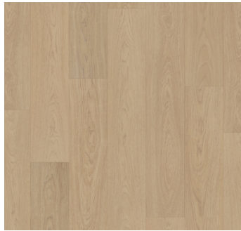
LIMESTONE OAK | 839