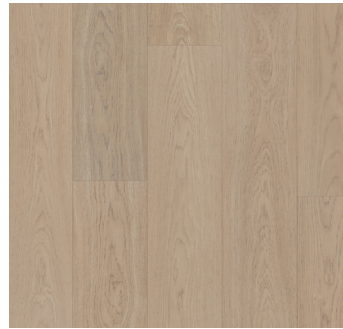
SANDSTONE OAK | 833