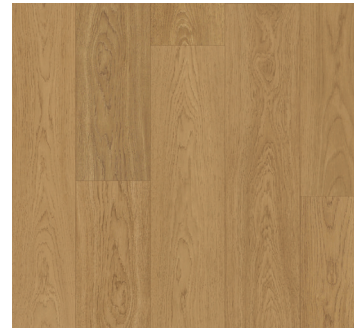
SEPIA CLAY OAK | 853