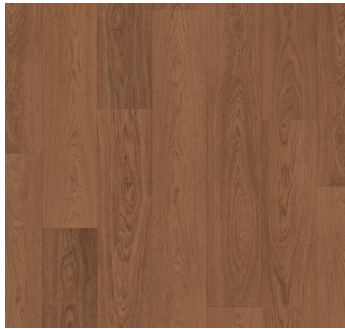
COCOA OAK | 352

Colors will stay vibrant for a lifetime and will resist fading from sunlight.