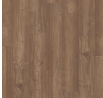
COCONUT ACACIA | 860