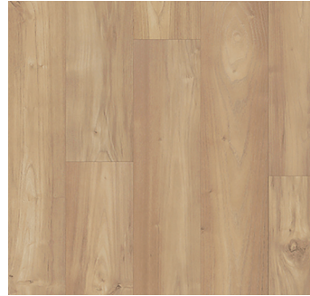
SESAME ACACIA | 149