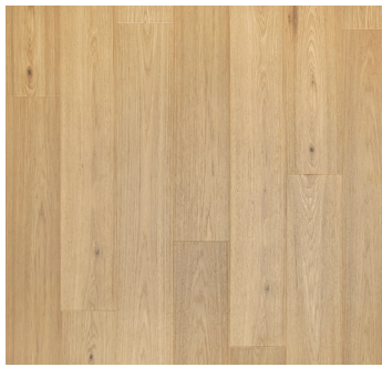
DESERT SAND HICKORY | 139

Colors will stay vibrant for a lifetime and will resist fading from sunlight.