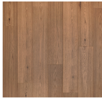
HAZELNUT HICKORY | 268