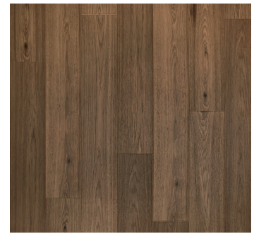
RUE BROWN HICKORY | 879