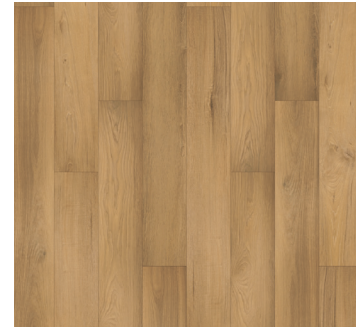
ELLIE | 866