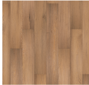
ANITA | 867