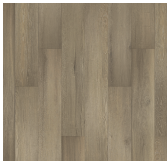
OLIVER | 971