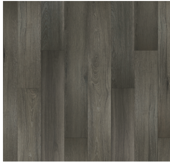
BARDOT | 992