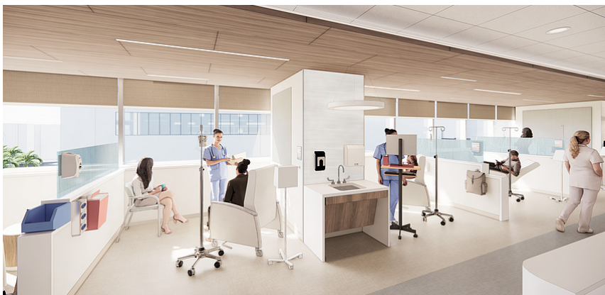
Systemic Therapy Suite, BC Cancer – Kelowna. Concept photo only.

Over 115 generous donors from across the Interior have come together to surpass the $6.1 million fundraising goal to bring a new, state-of-the-art Systemic Therapy Suite to BC Cancer – Kelowna.