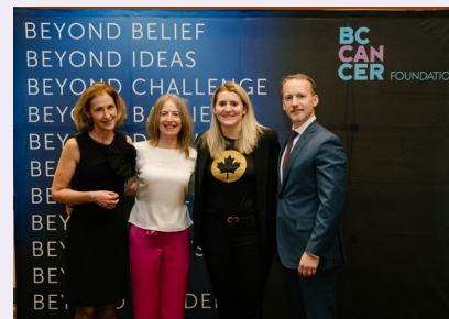
Exploring for a Cure event in Vancouver.