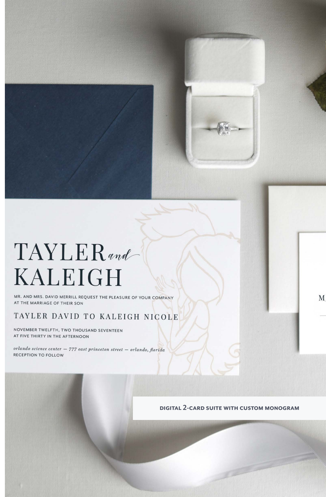
DIGITAL 2-CARD SUITE WITH CUSTOM MONOGRAM

All timelines are an estimate and can vary depending on the complexity of each design