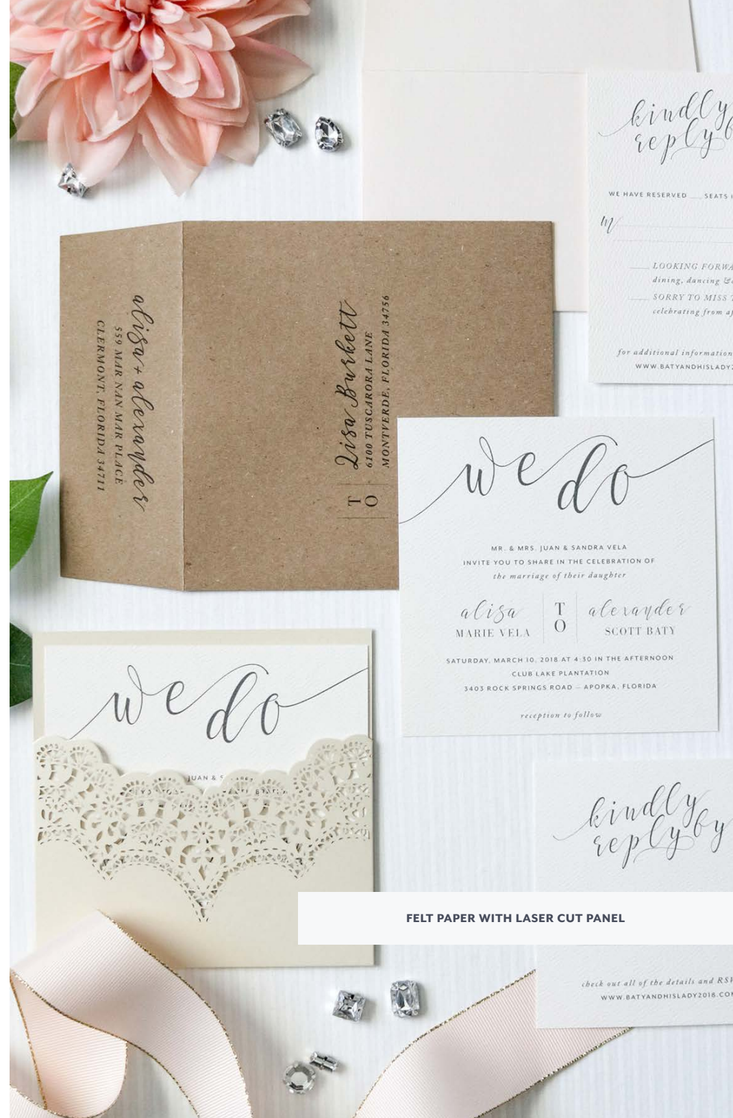
FELT PAPER WITH LASER CUT PANEL

All items above are individually priced, unless otherwise noted.