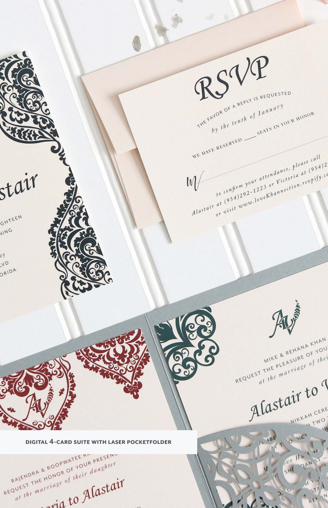
DIGITAL 4-CARD SUITE WITH LASER POCKETFOLDER