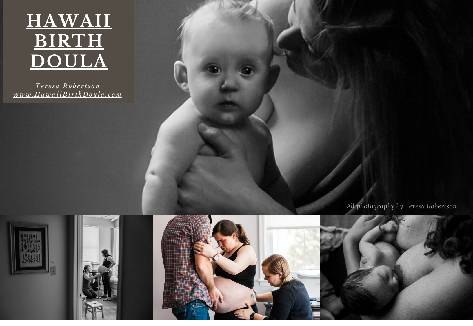
Birth Team - Resources & Local Options