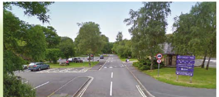
SETT VALLEY TRAIL CAR PARK ENTRANCE