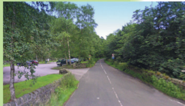
APPROACHING BOWDEN BRIDGE CAR PARK ON LEFT

UPPER HOUSE • KINDER • HAYFIELD • HIGH PEAK • SK22 2LJ