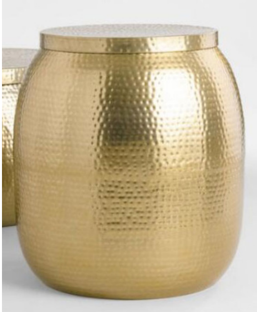
Gold Hammered Side Table

*Five pieces are included in the And Then Some package. Furniture is an add-on for all other packages.*