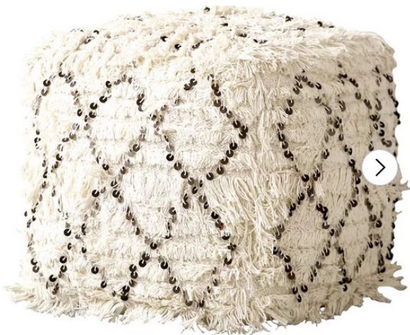
Moroccan Wedding Poufs