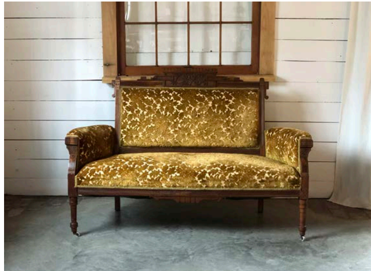
Antique Leaf Loveseat

Dimensions: 7.5' long x 36" deep x 19" high