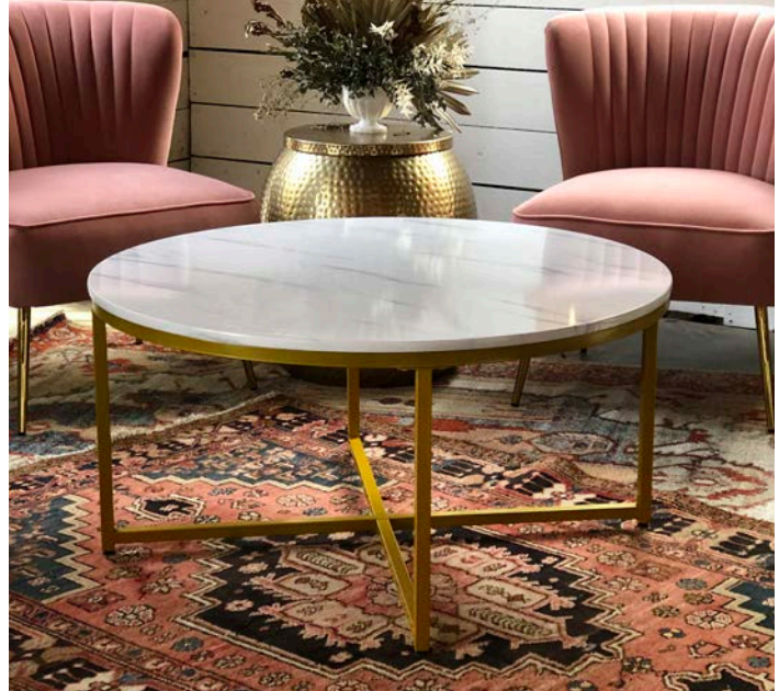
Gold and Faux Marble Coffee Table