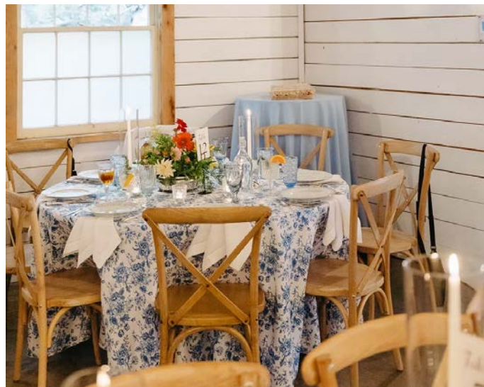
Table height: 30"