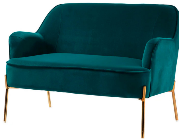
Indigo Blue Loveseat

Dimensions: 52" long x 27" deep x 35" high