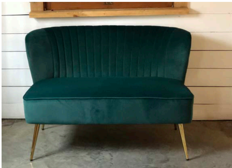
Emerald Green Loveseat