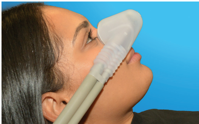
Traditional nasal mask

Like its predecessor, Porter's new and improved SILHOUETTE nasal mask is a translucent, single-use nasal mask and breathing circuit designed with lightweight tubing and a comfortable, conforming mask. It provides unobstructed access to the oral cavity and full range of motion for the patient.