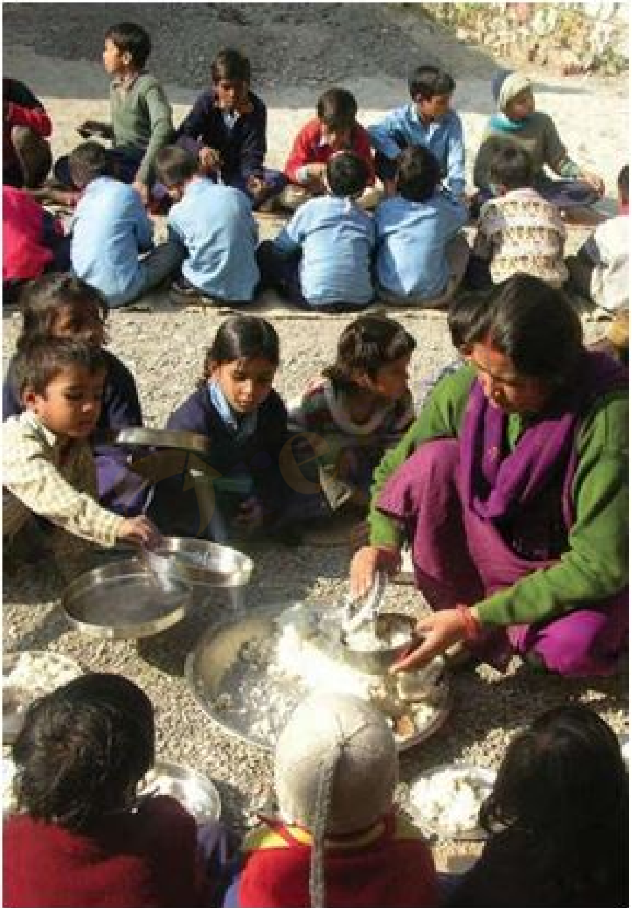
Children being served their midday meal at a government school in