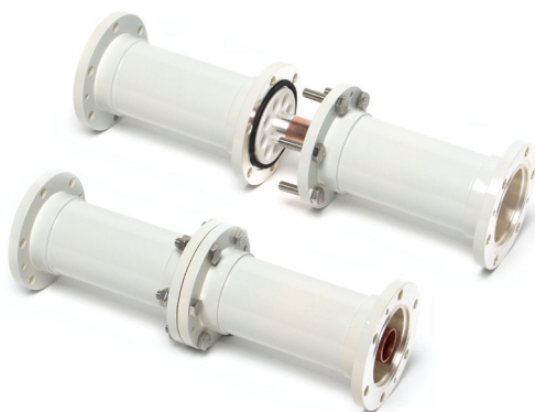
Flange coupling kit assembly