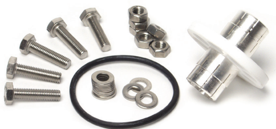
Flange coupling kit