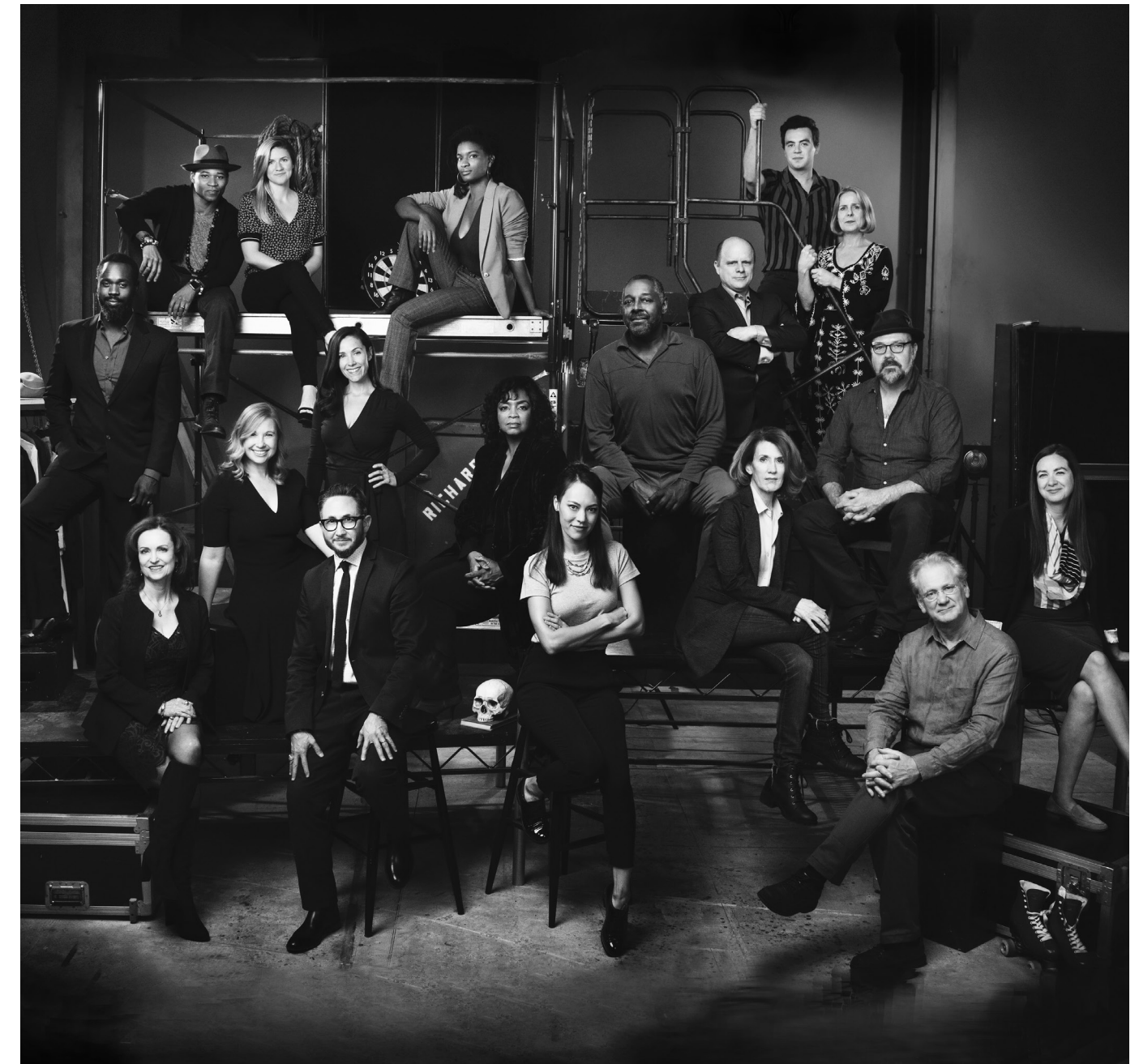
A selection of Block Party 2019 participants from Theatre of NOTE, Skylight Theatre Company, and Antaeus Theatre Company.

Special thanks to Diablo Sound. The closing song, "Ordinary Girls," is courtesy of Cheap Perfume, New York's first all-female punk band.