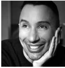
BIANCA DEL RIO/ ROY HAYLOCK