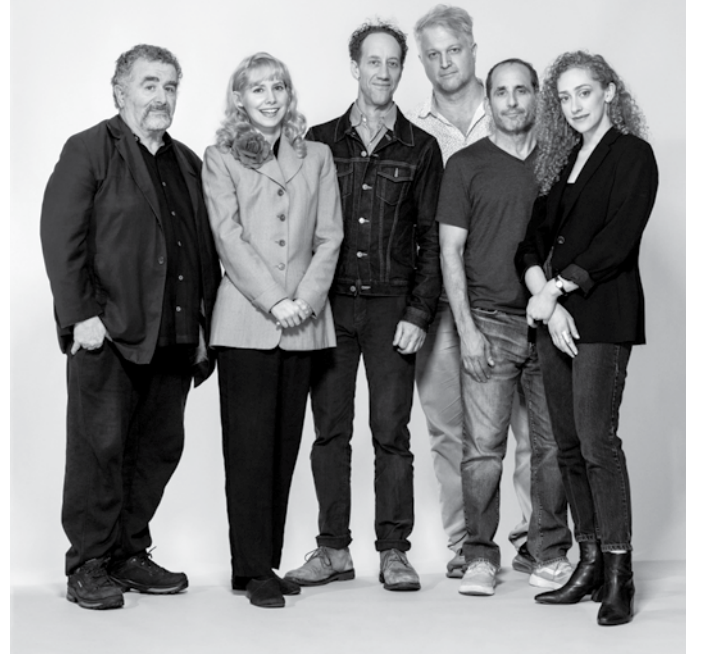
A TOUGH CASE