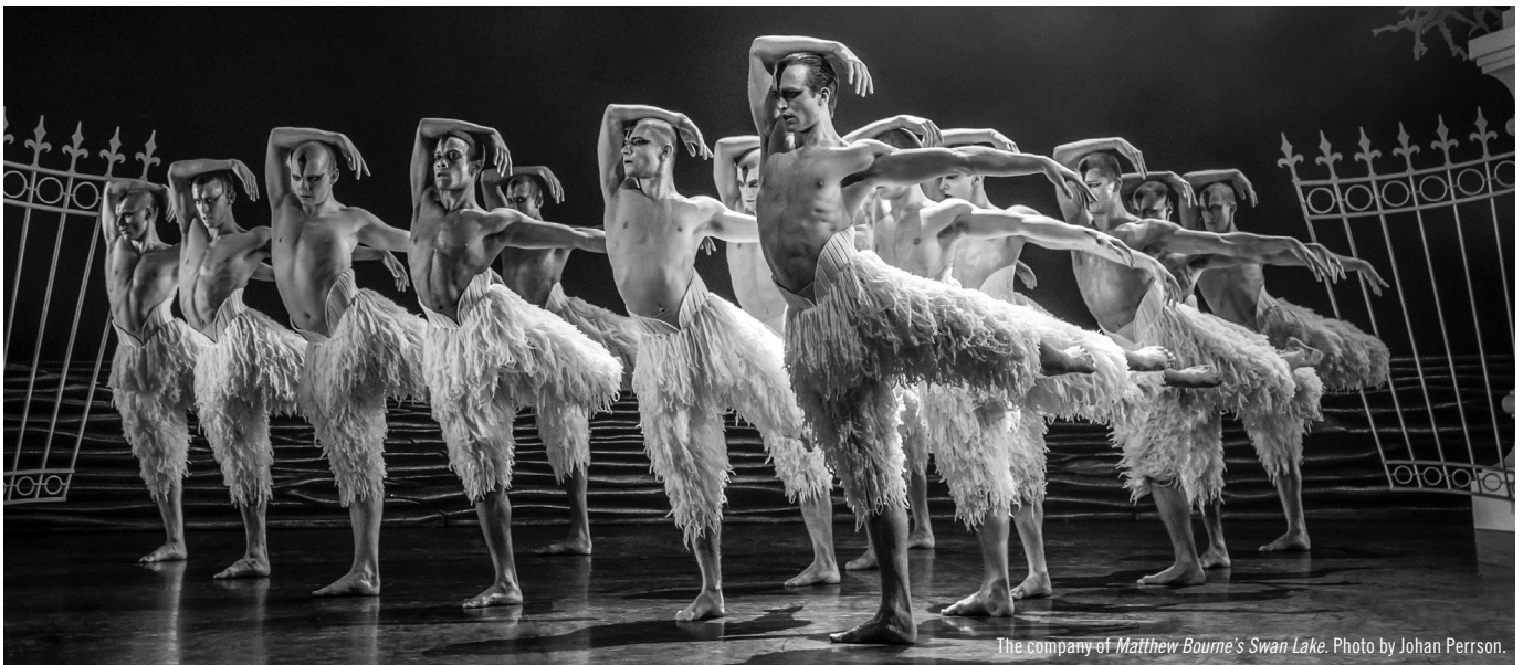
The company of Matthew Bourne's Swan Lake.

Matthew Bourne's Swan Lake will be performed with one intermission