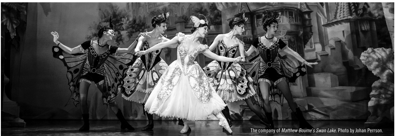
The company of Matthew Bourne's Swan Lake.