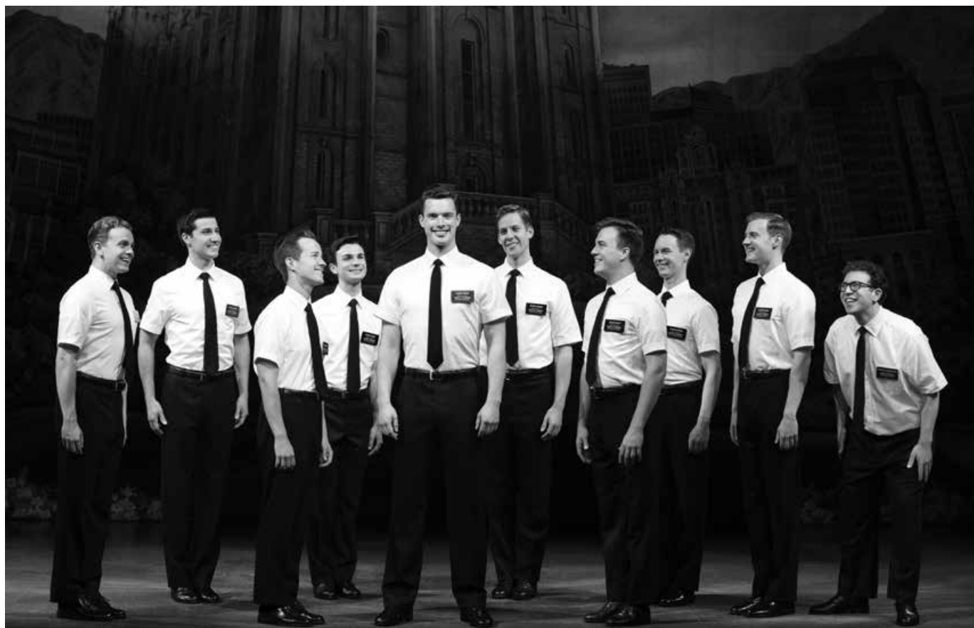
The company of The Book of Mormon.