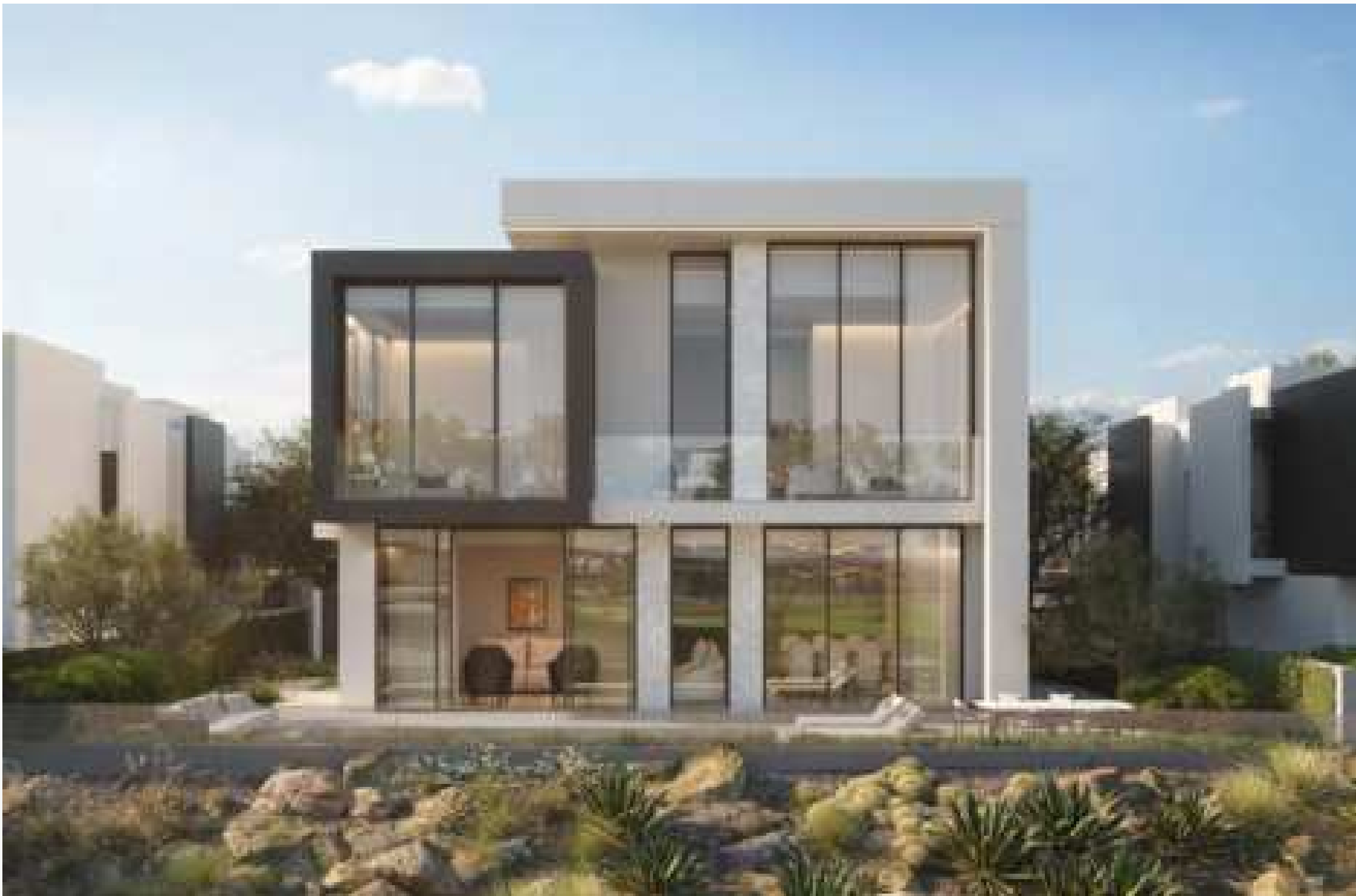
- REAR VIEW -