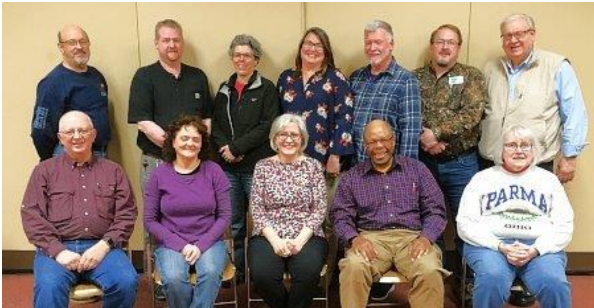
One jolly group of hams who just finished their exams following the 2019 CARS licensing classes.