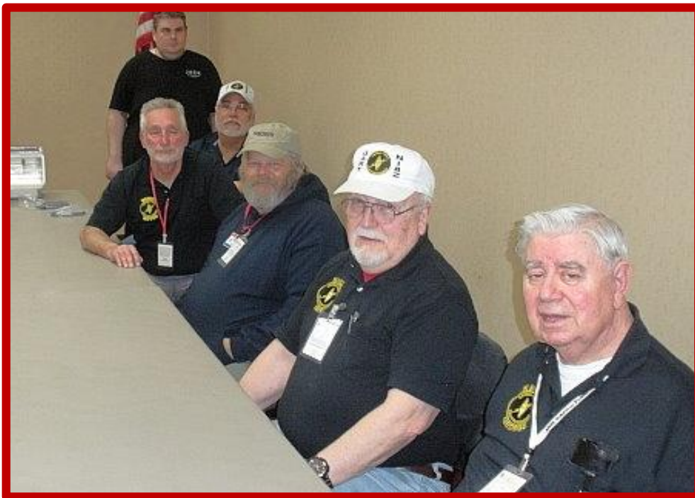
The experienced and capable CARS VE team ready to rock before the licensing class VE session.

[Submitted by Bob, W8GC, from the CPSC website. Ed.]