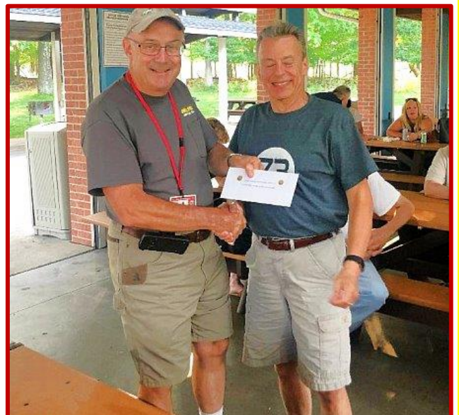
Arp's, K8ARP, good luck continued as he won a gift certificate