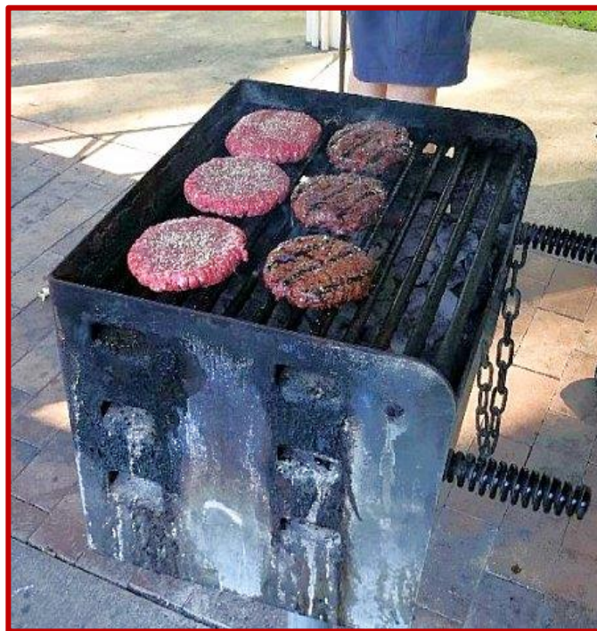
The burgers sizzled on the grill at the CARS summer picnic.