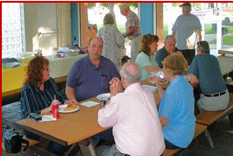
Part of the group of members, friends, and relatives that had a great time at the picnic