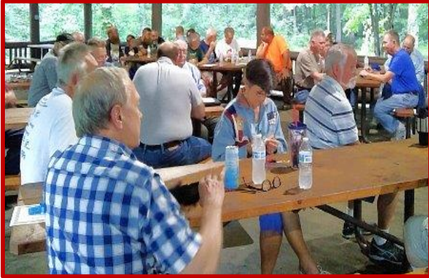
The group at the August meeting was quite interested in the FT8 demonstration.

We will have one of our popular dinner meetings in October. We can decide where we want to go at the September meeting. The last few dinner meetings have been at Simon's in Brecksville. Everyone seems to be happy with Simon's, so it has evolved into our default dinner meeting venue. If there are other suggestions, we can entertain them at the next meeting and make a decision as to where to go. Any suggestions should be scrutinized with our requirements and preferences. We need a private room with no extra charge, prefer to be able to order off the menu, and dislike compulsory gratuities. If anyone is considering a new venue, please check out our requirements in advance of the meeting.