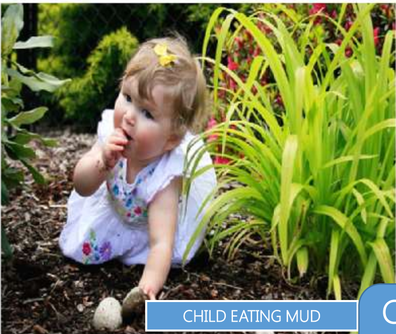
CHILD EATING MUD