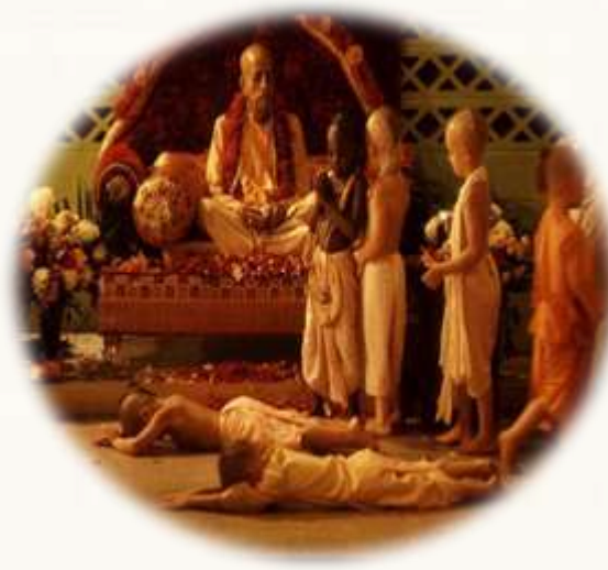
SP giving Darshan to devotees