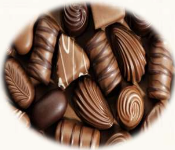
Image of chocolate