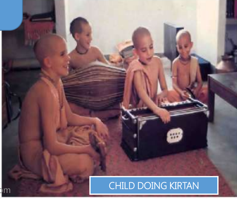
CHILD DOING KIRTAN