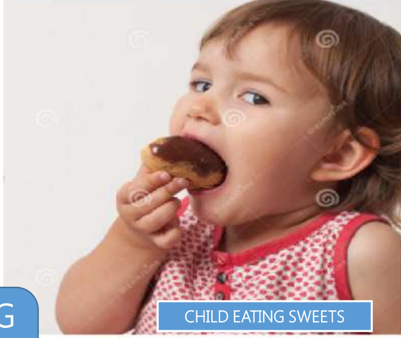
CHILD EATING SWEETS