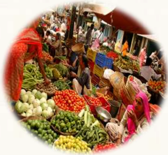
Market with fruits and Vegetables