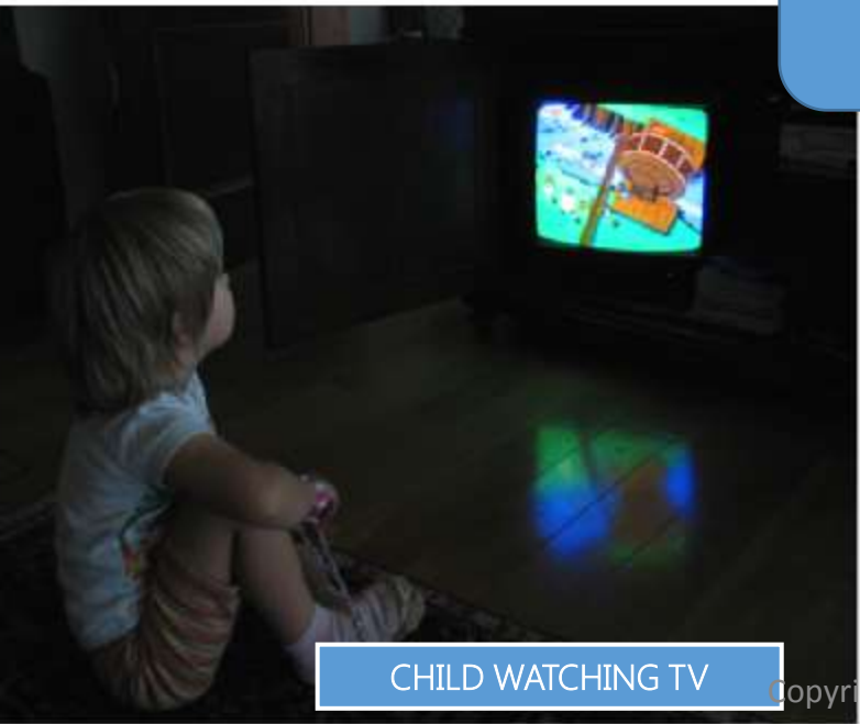
CHILD WATCHING TV